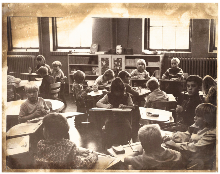
Students work in their desks at Holy Family School in this undated archive photo. Do you know anyone in this photo? Do you know where this was taken?